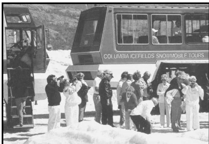
On the Athabasca Glacier