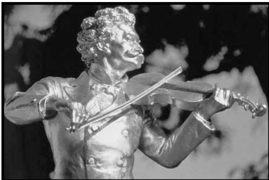
Johann Strauss Monument in Vienna

We arrive in Vienna, once the capital of the mighty Habsburg Empire, where we have free time to rest or explore the city where we lodge two nights.