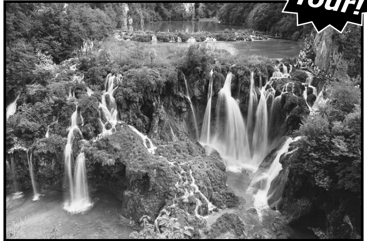
Plitvice National Park