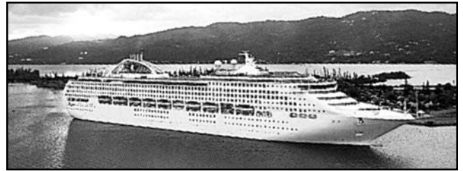
The Island Princess ®

4-Night Alaska Land Tour 7-Night Inside Passage Cruise Vancouver Sightseeing