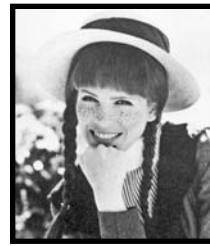
Anne of Green Gables