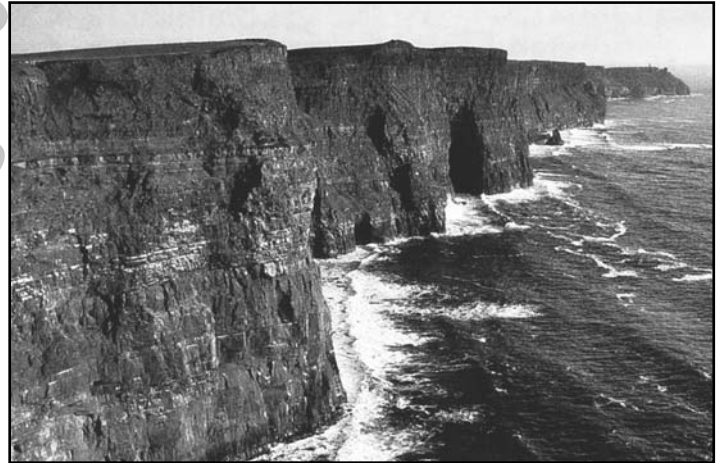
The breathtaking Cliffs of Moher