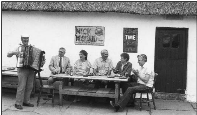
Fun at an Irish Pub