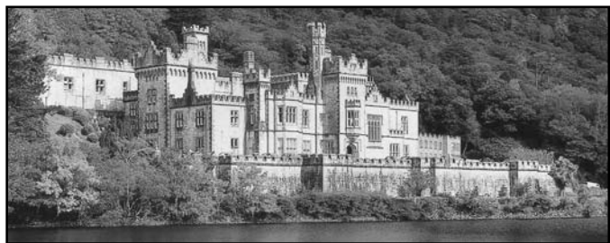
Lakeside Kylemore Abbey, Connemara

At Kylemore Abbey we tour the restored castle, church, and gardens of the Benedictine nuns. We pause in Westport, Knock, and Drumcliff (where the poet W. B. Yeats is buried) en route to the resort of Bundoran, where we lodge two nights.