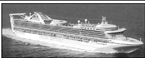
Relaxing days at sea on the Golden Princess ®, a spectacular ship with great entertainment and activities.

Hawaii is a world of volcanic mountains, dense rain forests, coral reefs, white sand beaches, and crystal blue waters. Here is the Pacific paradise you've always yearned for. Here is the Pacific paradise you've always imagined. By cruising the islands, you'll get to see more of Hawaii, and at a pace you can enjoy. There are no long flights to Hawaii, just relaxing and fun days at sea on the exciting Golden Princess .®