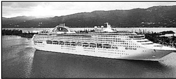
The Golden Princess ® is an impressive ship with all the amenities & beautiful decor. Get ready for a spectacular cruise experience!

Juneau, Glacier Bay Cruising, Skagway, Ketchikan, Victoria