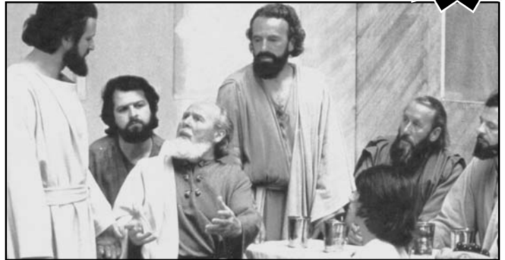
OBERAMMERGAU PASSION PLAY—Details on Page 45