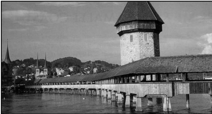
Lucerne's Chapel Bridge

We drive through the lush Lombardian plains into Italian-speaking southern Switzerland. In the resort city of Lugano, we can stroll along the flower-festooned shore of Lake Lugano and browse through the shops of Via Nassa. Then we admire the towering majesty of the Swiss Alps as we cross St. Gotthard Pass. After passing through William Tell country we reach the captivating city of Lucerne. Here our walking tour includes the Lion Monument , the ornate patrician houses lining the cobbled streets of Old Town, and the famous covered Chapel Bridge leading to the Jesuit Church. We lodge one night in Lucerne.