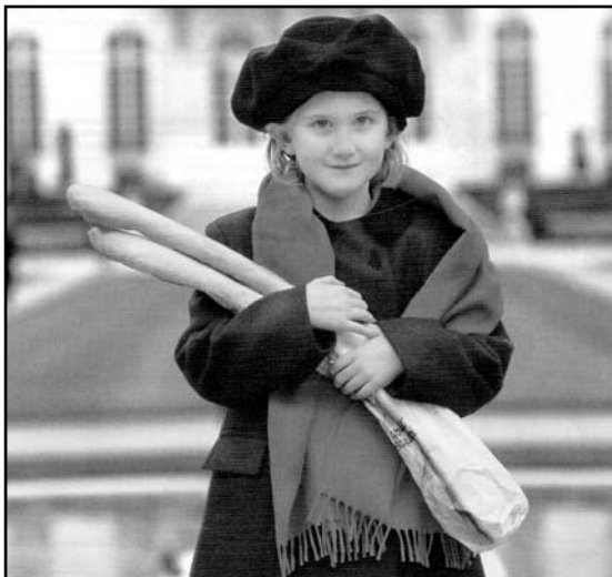
Parisian Mademoiselle with Baguettes

We have a free morning to relax, explore Lucerne, shop for high-quality Swiss products, or join an optional excursion into the mountains. Then we drive to Montreux, a cosmopolitan resort with a mild climate and superb location on Lake Geneva, where we lodge one night.