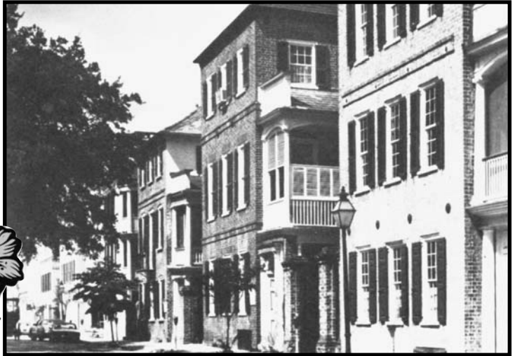
Charleston, South Carolina