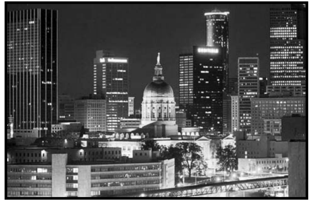
Georgia State Capitol Building and Downtown Atlanta

At the Federal Reserve Bank of Atlanta we learn how "The Fed" affects our lives and see about our country's financial system and see the cash-processing operations, where millions of dollars are counted, sorted, or shredded daily. We then take a behind-the-scenes tour of the "Fabulous Fox" Theater, built in the late 1920s and beautifully restored to its original grandeur. At the Jimmy Carter Presidential Library and Museum we learn about the life of this remarkable American and see memorabilia from the Carter presidency. Then we transfer to the Atlanta airport for our flight home with lingering memories of the beauty of the Old South in the Spring.