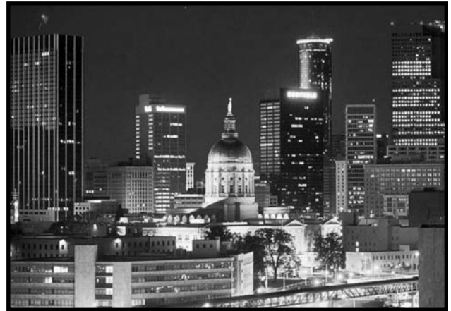
Georgia State Capitol Building and Downtown Atlanta

At the Federal Reserve Bank of Atlanta we learn how "The Fed" affects our lives and see about our country's financial system and see the cash-processing operations, where millions of dollars are counted, sorted, or shredded daily. We then take a behind-the-scenes tour of the "Fabulous Fox" Theater, built in the late 1920s and beautifully restored to its original grandeur. At the Jimmy Carter Presidential Library and Museum we learn about the life of this remarkable American and see memorabilia from the Carter presidency.