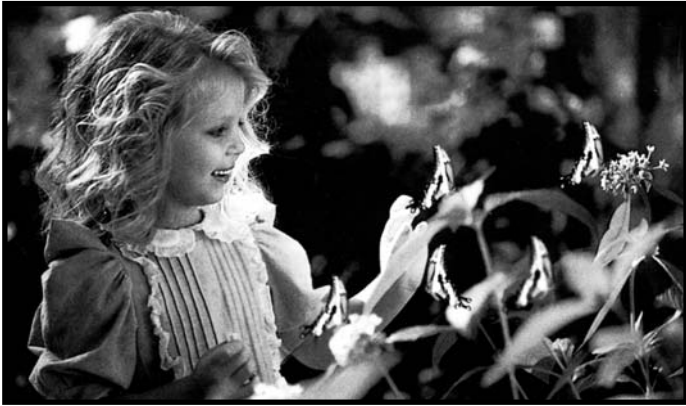
Butterfly Center at Callaway Gardens, Georgia