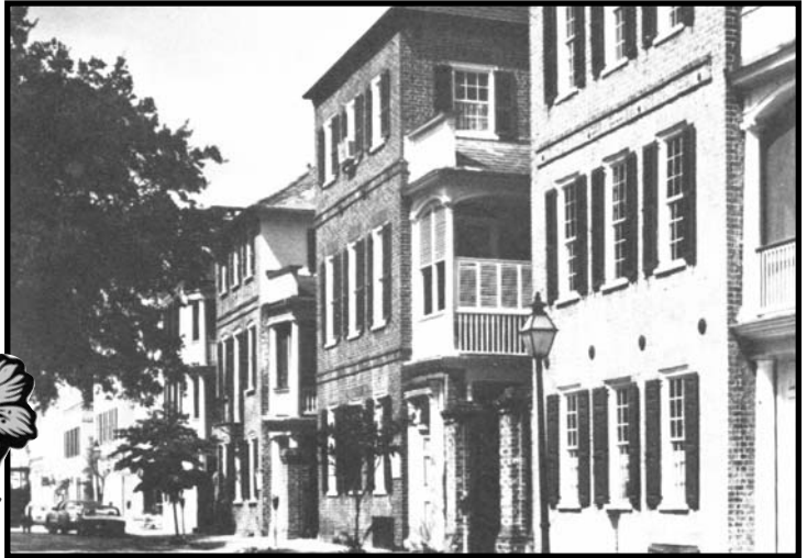
Charleston, South Carolina