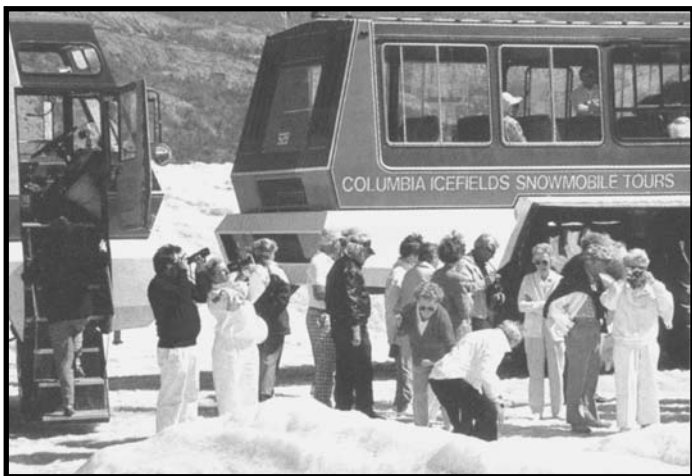
On the Athabasca Glacier