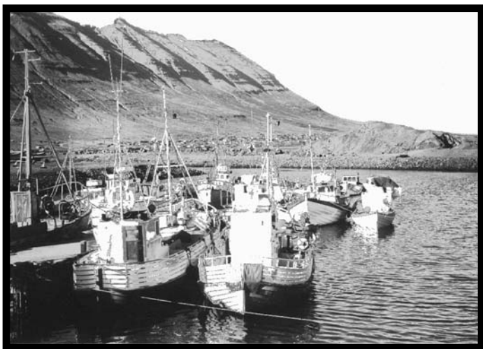
Typical Iceland fishing village

Leaving the oasis of Lake Myvatn we visit sulphur slopes, boiling mud pools, and recent lava flows in the colorful landscape near Namaskard Pass. Then we cross the empty vastness of the highland desert plateau to the town of Egilsstadir to lodge one night.