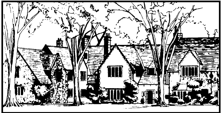
Edsel & Eleanor Ford House

A guide joins us for a tour of Detroit. Belle Isle, downtown Detroit, and the mansions of Grosse Pointe are highlights. Then we tour the house of Edsel and Eleanor Ford on Lake St. Clair. Because everything in the house is original, it almost seems as though the Fords still live here! This afternoon we fly home with memories of gorgeous fall foliage and the friendly travelers who made this tour special.