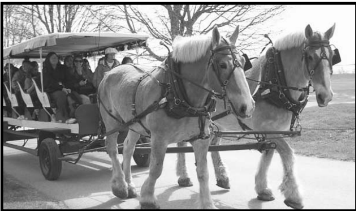
Horse-Drawn Carriage on Mackinac Island

Mackinac Island is like returning to another world and another time. Transportation here is by horse-drawn carriages and bicycles only. After a leisurely carriage tour of the island, we feast at the Grand Hotel's luncheon buffet. Then we have a free afternoon to explore the island's attractions and shops. Two nights' lodging on Mackinac (pronounced "Mackinaw") Island.