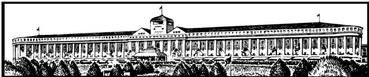
Lunch at the Grand Hotel on Mackinac Island

Wisconsin Dells is the region's favorite vacation destination. We sail on the Mark Twain through the "Dells" of the Wisconsin River in Upper Dells Glacial Park. The rock formations punctuate the fresh evergreens along the river. We then drive to the AirVenture Museum of the Experimental Aircraft Association in Oshkosh to see some of its 20,000 historic aviation objects including 150 aircraft. Later we reach Green Bay, proud home of the Packers, where we lodge one night.