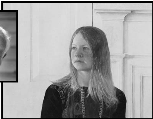
Siri 1970 (detail)