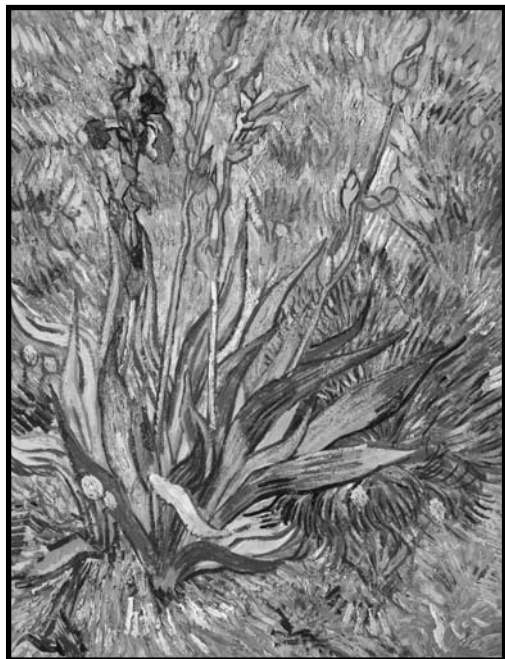
Vincent van Gogh Iris 1889 (detail)