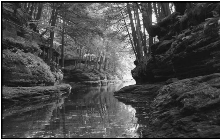
Wisconsin Dells