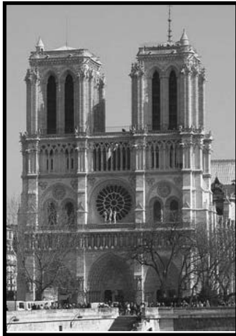
Notre Dame Cathedral - Paris