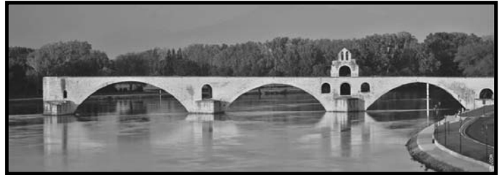
The Pont d'Avignon

A local guide takes us on a walking tour of Arles, whose vibrant colors and striking quality of light has inspired artists like Vincent van Gogh. We see the impressive Roman Les Arènes, an arena that seats 20,000 and is still in use, and the 15th century Romanesque church of St. Trôphime. The afternoon is free time for exploring this charming and historic city.