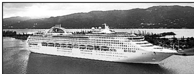
The Island Princess ®

4-Night Alaska Land Tour 7-Night Inside Passage Cruise Vancouver Sightseeing