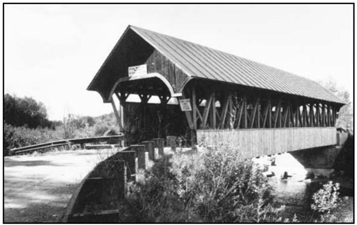
A Covered Bridge in Vermont

We cross the White Mountains and the Connecticut River to reach Vermont. Quechee Gorge is an impressive sight. In Woodstock we tour the Marsh-Billings-Rockefeller Mansion, built in 1805, and its lovely gardens. We enjoy free time in Woodstock, the "quintessential New England village." There is a covered bridge in the middle of town and stately homes surrounding the village green. At Plymouth Notch we visit the birthplace, boyhood home, and grave of Calvin Coolidge. The village, though one hundred years old, is in a perfect state of preservation and allows us to recall a simpler era. Two nights' lodging in Rutland.