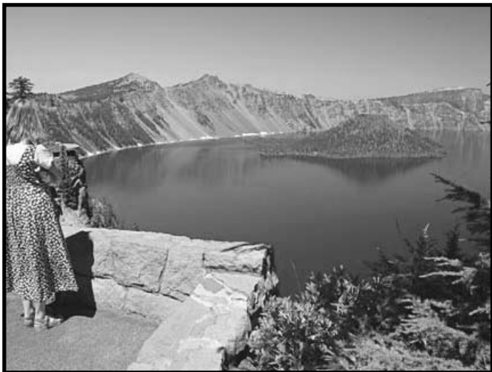
Crater Lake National Park