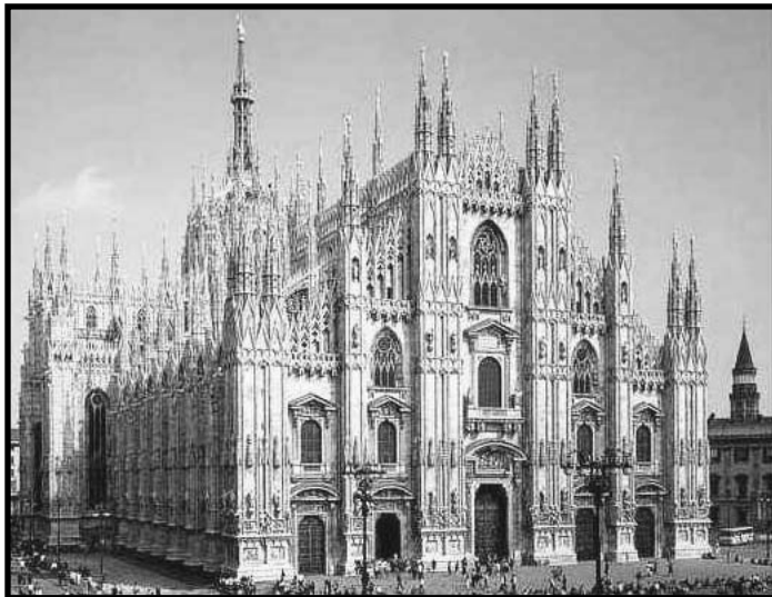
Cathedral in Milan

DAY 8 MILAN / VERONA / VENICE B We drive east to Verona, the medieval setting for Shakespeare's Romeo and Juliet . On a walking tour of Verona we see Juliet's balcony and the Verona Arena, one of the best preserved Roman amphitheatres in Italy that is now used for opera performances. We continue to Venice, where we lodge two nights, entering in style on a Private Boat .