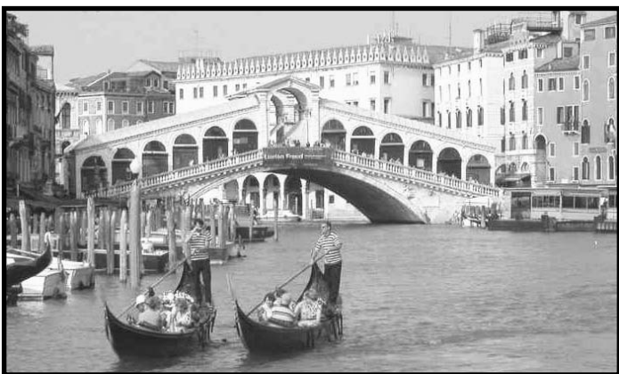
Gondolas at Venice's Rialto Bridge

DAY 10 VENICE / RAVENNA / ASSISI B,D We follow the sparkling Adriatic coastline to Ravenna, where we see the famous mosaics in the 6th-century Basilica of St. Apollinaris in Classe . In the afternoon, we continue on to Assisi where a local guide leads us to St. Clare's Church and the 13th-century Basilica of St. Francis , where St. Francis is buried. We lodge one night in Assisi, where we enjoy free time in one of Umbria's most charming towns.