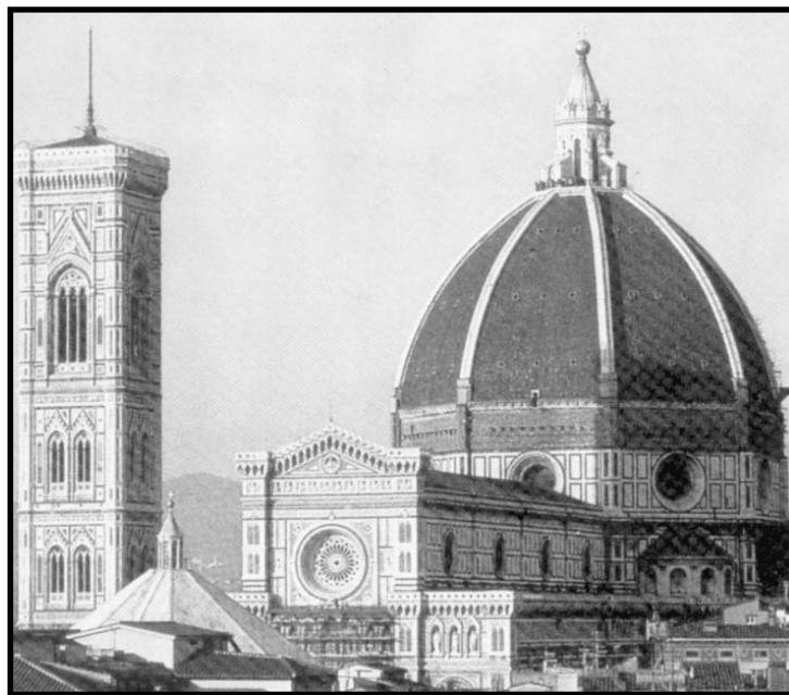
Cathedral (Duomo) and Bell Tower of Florence