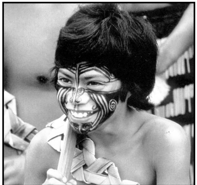
Young Maori Warrior in New Zealand