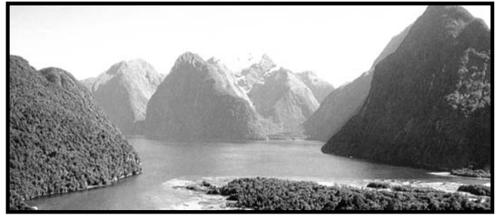
Milford Sound in Fjordland National Park