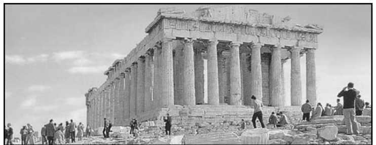
Parthenon on the Acropolis

The mystique of this island of clear light, bright flowers on whitewashed walls, and aquamarine water is timeless. Here you can roam the perfect beaches, see sun-splashed windmills, and fine shops galore along cobblestone streets. The ancient archaeological site of Delos can be visited on an adjacent island.