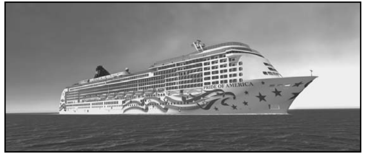
Pride of America

January 21 - 30, 2011 10 Days From $2,080 00