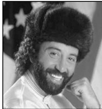
Yakov Smirnoff "What a Country!"

Shows may be changed by the theaters or Sun Tours without prior notice.